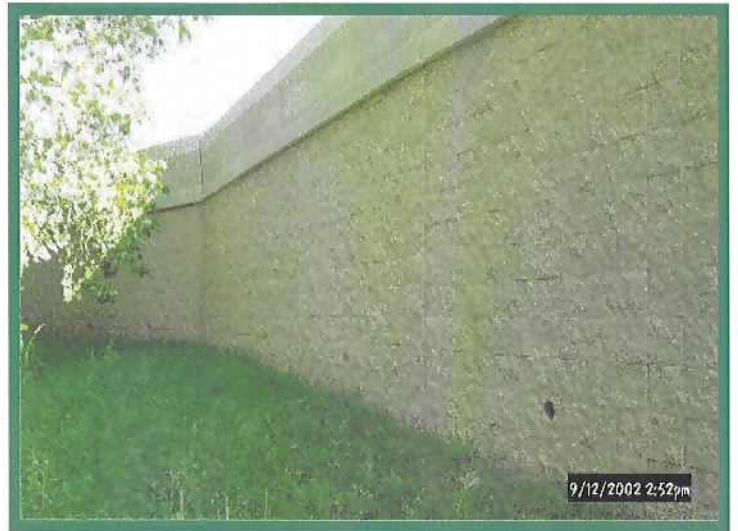
SPLIT FACED BLOCK – DRY LAID (12013)