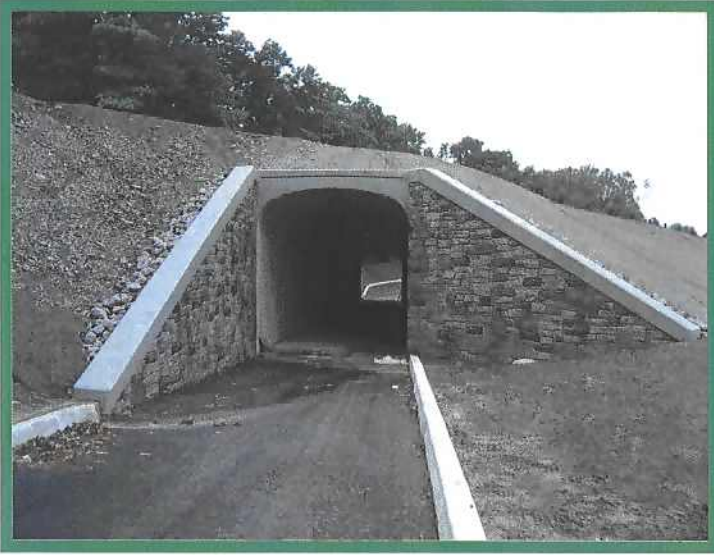
MINNEHAHA BLEND (12010)