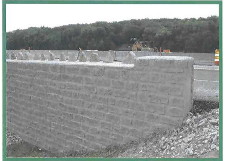
OHIO LIMESTONE (12018)